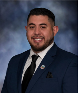
Carlos Marquez Mayor